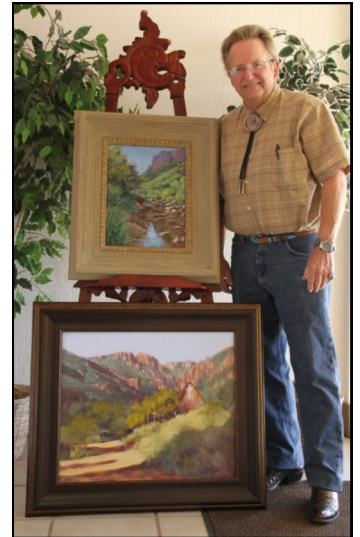
Information for this article obtained from www.napperfineart.com

He describes his connection with BTSR as, "my home away from home when I was growing up. I watched when this Chapel was constructed and have spent many hours under its roof. This past August I was visiting the ranch during an OA work weekend, painting a couple of Plein air paintings and taking many photos."